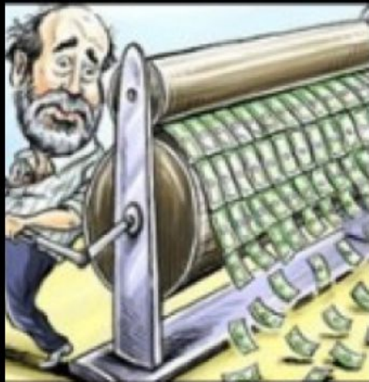
What my boss thinks I do