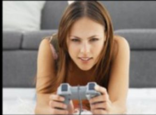
What my mom thinks I do