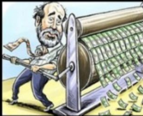
What my boss thinks I do