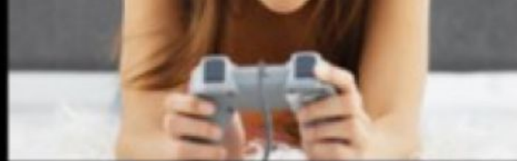
What my mom thinks I do